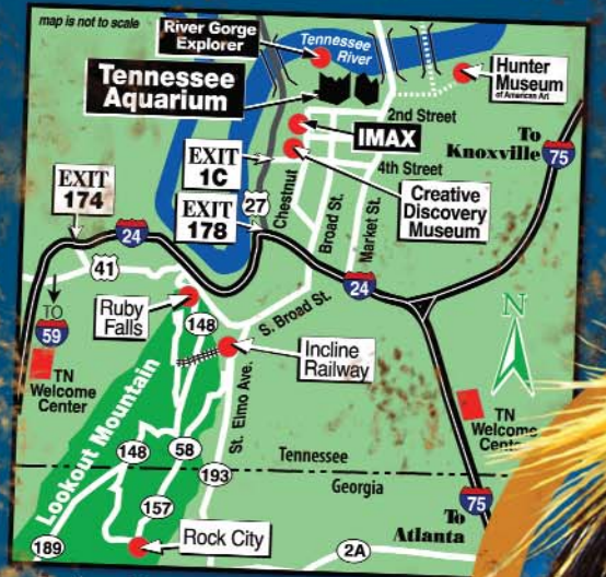
Lookout Mountain attractions are less than 15 minutes from downtown Chattanooga.